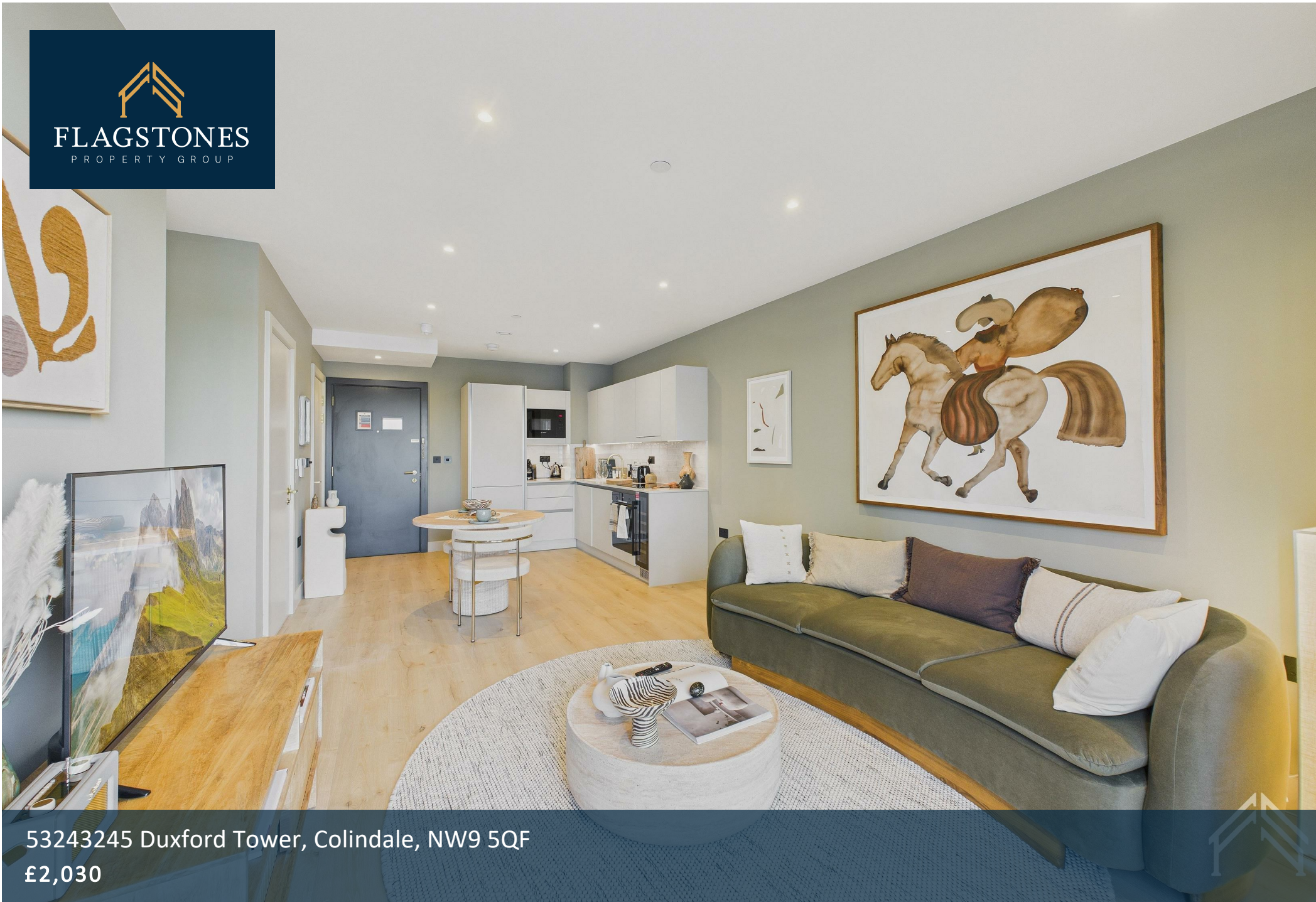
53243245 Duxford Tower, Colindale, NW9 5QF £2,030